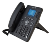
Halo series (for example H6)