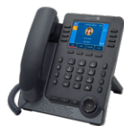
Myriad series (for example M7)